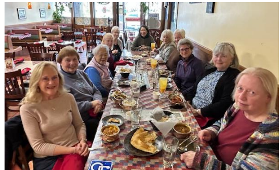
At Gurkha Kitchen for lunch, 12 members enjoyed the delicious food and lively company!