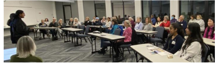
Tech Trek campers recall impact of camp experience.

We also enjoyed presentations by three Tech Trek campers, who described their camp experience and how it affected their worldviews.