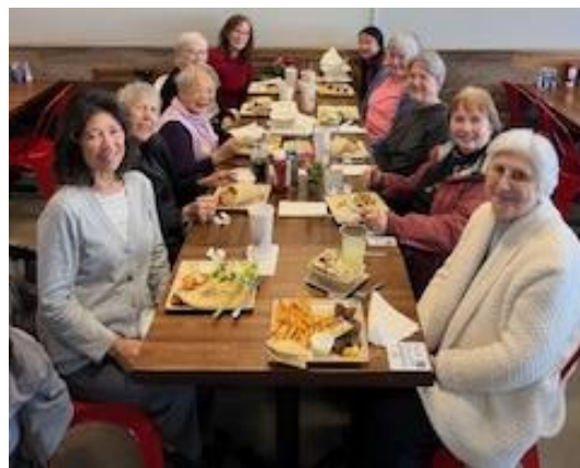
At The Great Greek on January 4, 10 Lunch Bunch members enjoyed the delicious food and lively company.