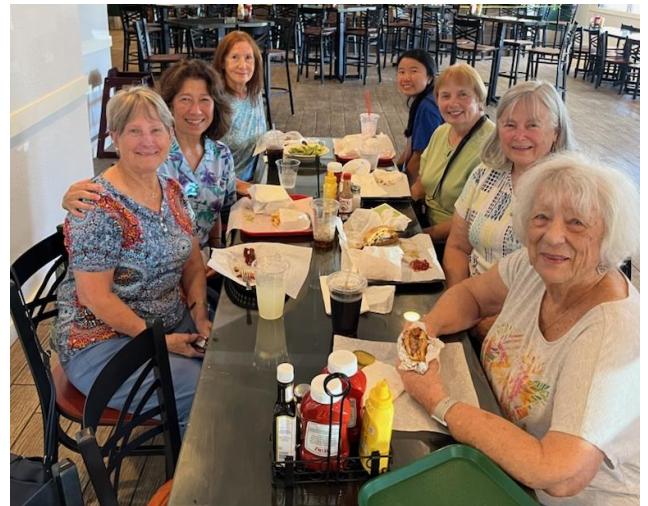
Lunch Bunch enjoys dining at Athen's Burgers in Dublin.