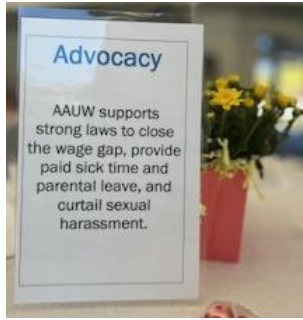
AAUW in Action: The Advocacy Component