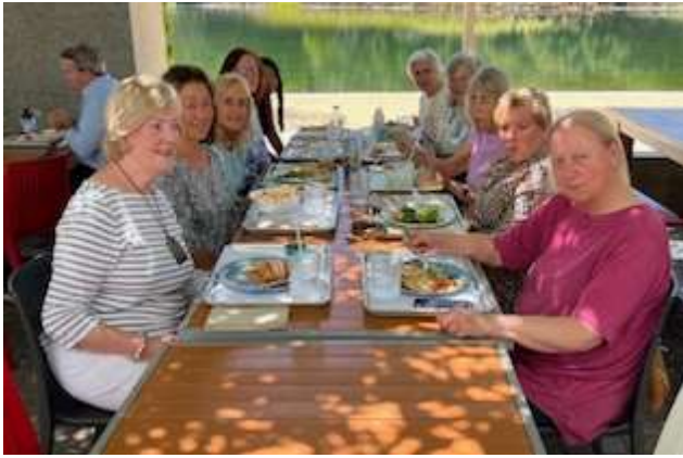
Lunch Bunch dines at a lakeside table at The Roundhouse in August.