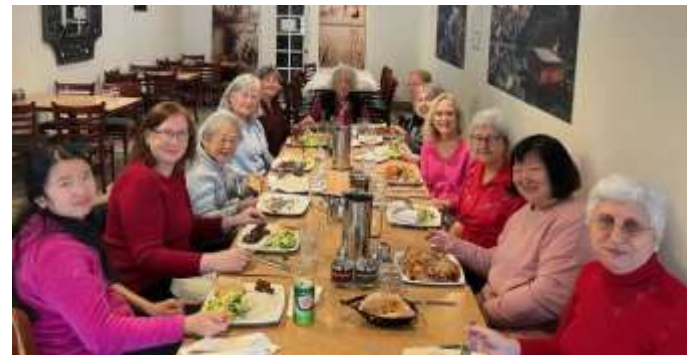
The Lunch Bunch dining at Chopan Kabob in February. We'll be at Dos Coyotes on March 5—join us!