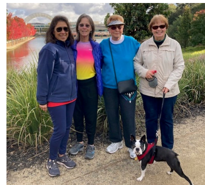
Walking Group rocks on