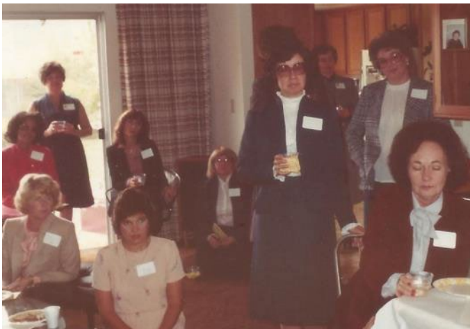
The first San Ramon Branch