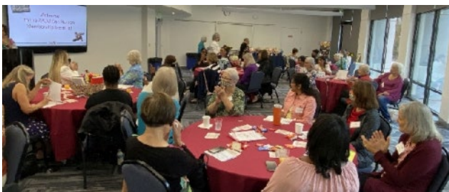
Our first hybrid Membership Event is a hit!

We look forward to “seeing” you at future programs, events, and meetings.