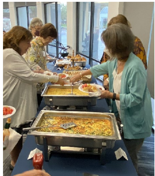
And, of course, there was a yummy brunch.