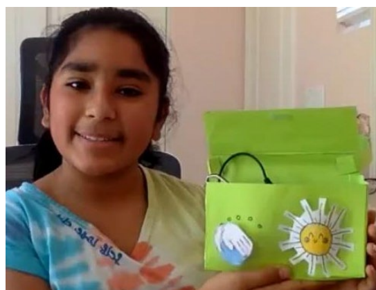
Tech Trek project: Stay-clean purse

SAVE THE DATE Tech Trek's major fundraiser, "Tips for Change," is February 6, 2023, at Gianni's Italian Bistro. Join us. And thank you to all who signed up to be wait-staff and "earn" our tips. It will be a lot of fun!