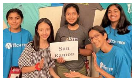
Our five Sonoma campers. The sixth did not attend. Two more took the virtual option.

There will be a 2023 Tech Trek camp. We again hope to send six girls to in-person camp and two to virtual.