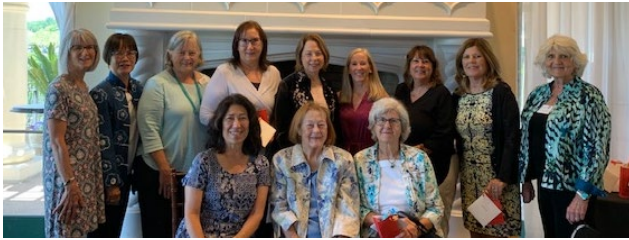
Board Members at the Celebration Luncheon

Below are some photographs from our celebration.