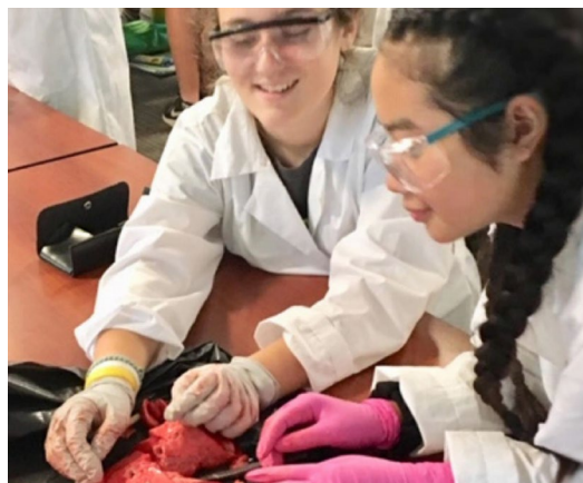
A volunteer from AAUW observes a Tech Trek camper performing an experiment.

Residential and virtual camps are humming along with plans for 2022 camps. The sponsorship fee for in-person camp is $1,000 for Sonoma State, the same as in 2019. The virtual camp fee will be $500.