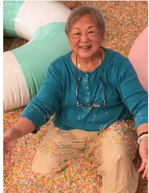
At the Museum of Ice Cream, San Francisco